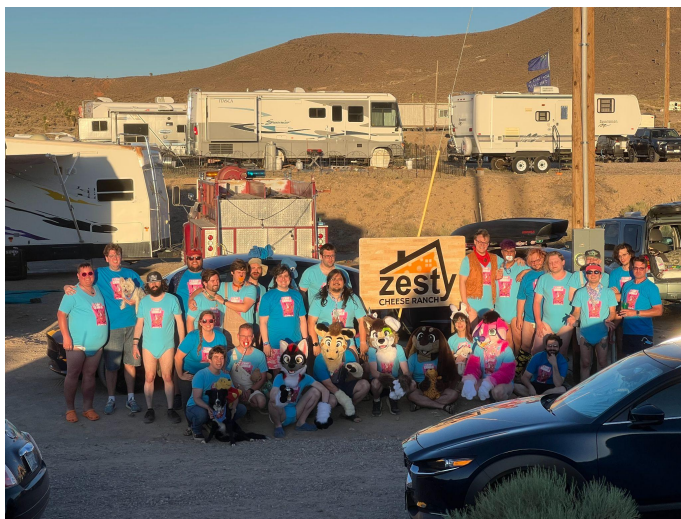
Camp Crinkle, Summer 2022