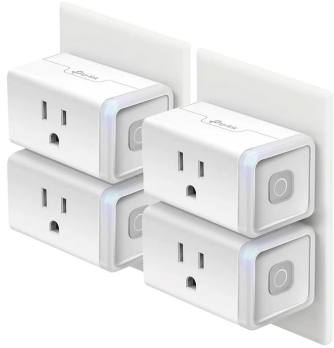
Power Button on the side!

In the winter months we use space heaters to keep the place warm. There are three heaters total and you may use them anywhere you like. They should be on prior to arrival, if not you may need to click the button on the Wi-Fi box. Then once the heater has power you may adjust the temperature as desired.